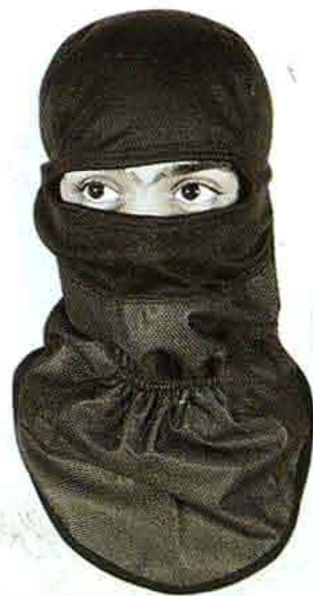
WIND STOPPER BLACLAVA