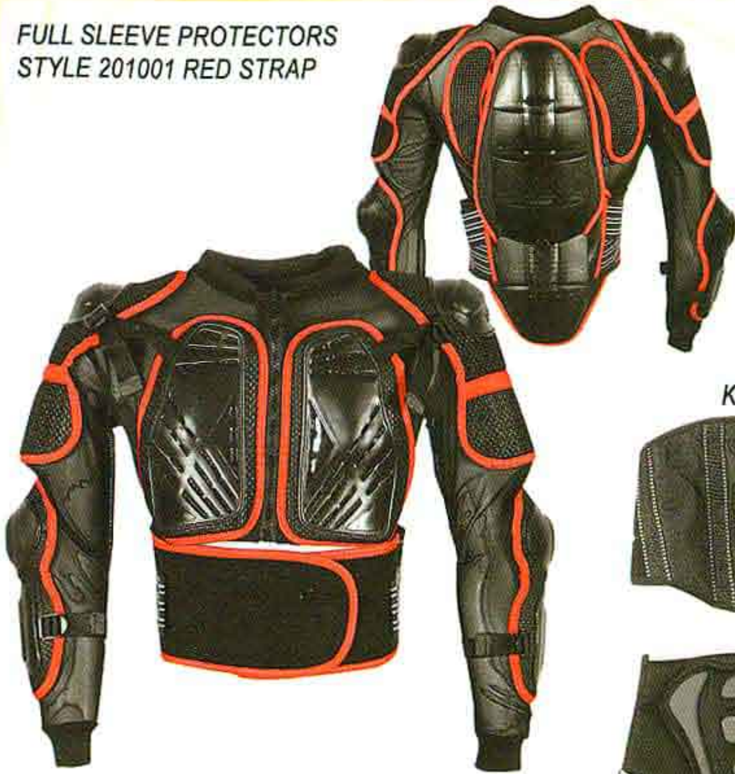
FULL SLEEVE PROTECTORS STYLE 201001 RED STRAP