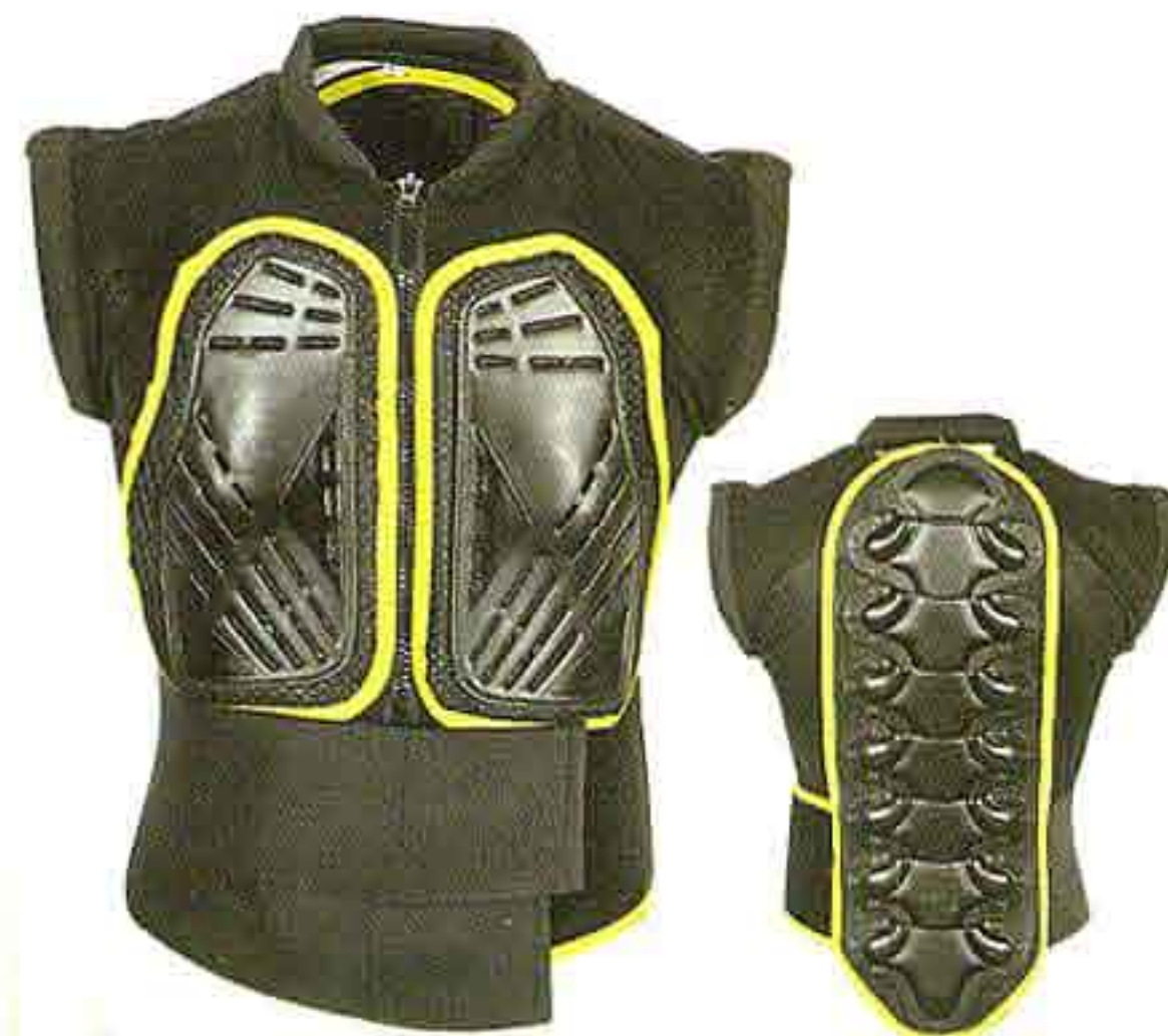
SLEEVE LESS PROTECTORS STYLE - 201101 ORANGE