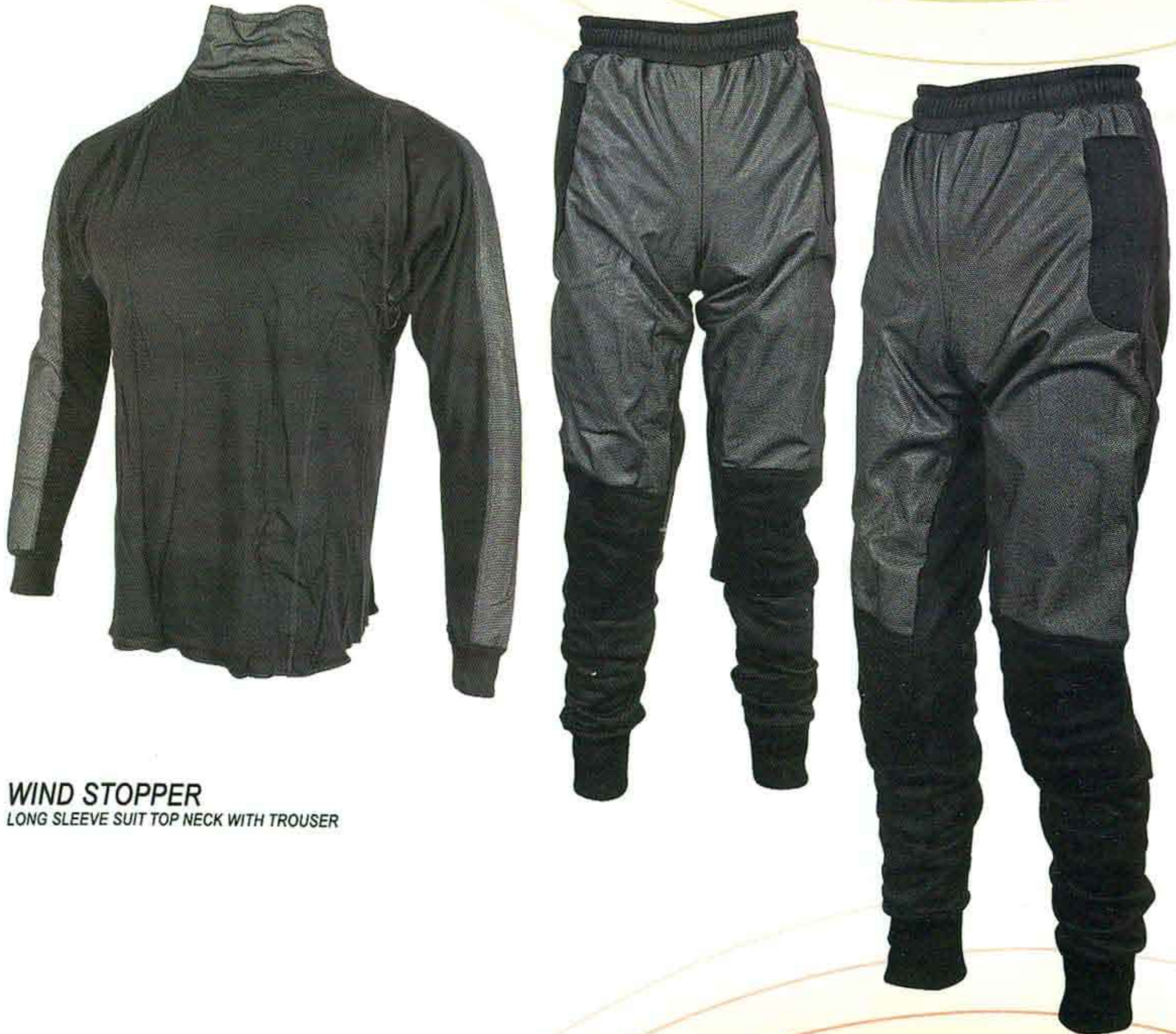
WIND STOPPER LONG SLEEVE SUIT TOP NECK WITH TROUSER