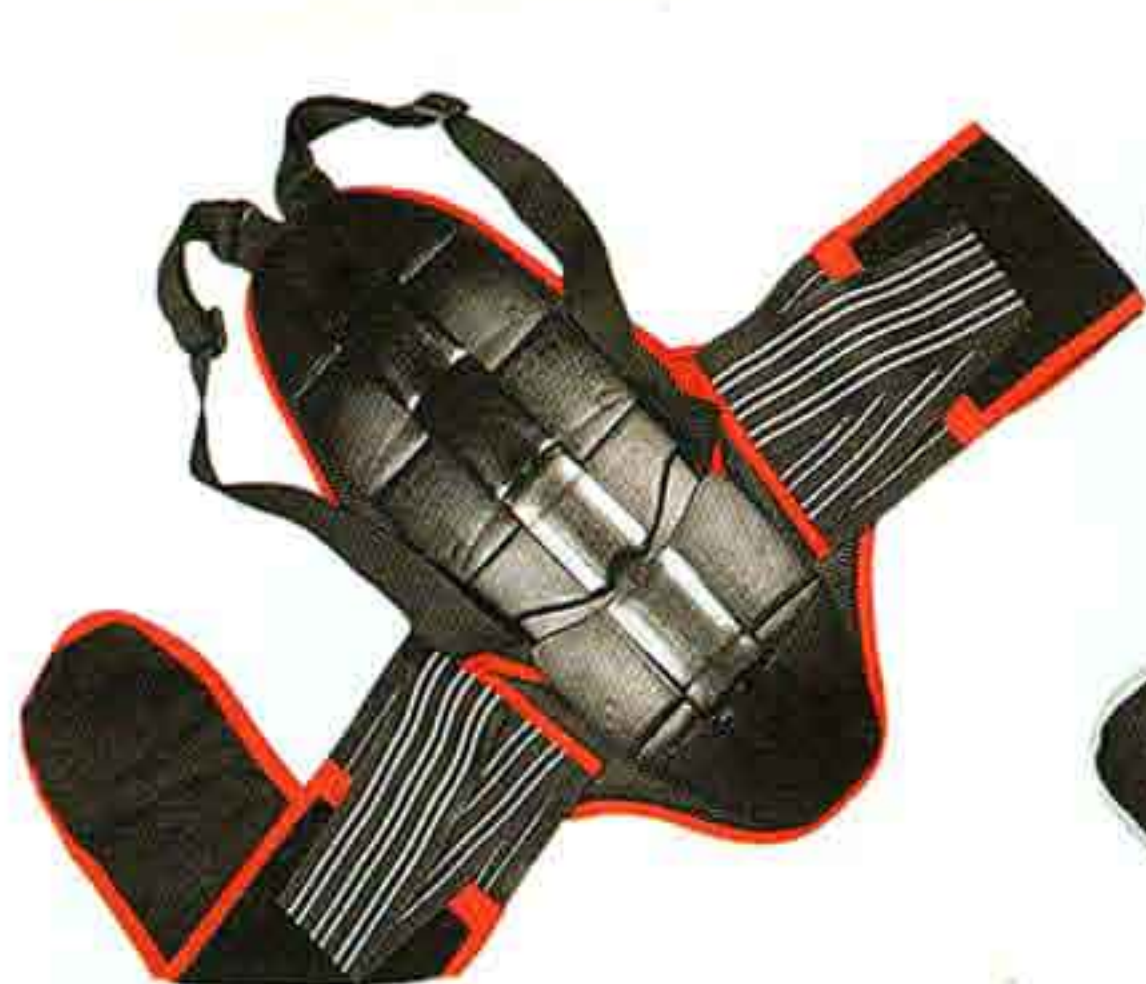
BACK PROTECTOR STYLE 2010 RED STRAP - 06 PANNELS