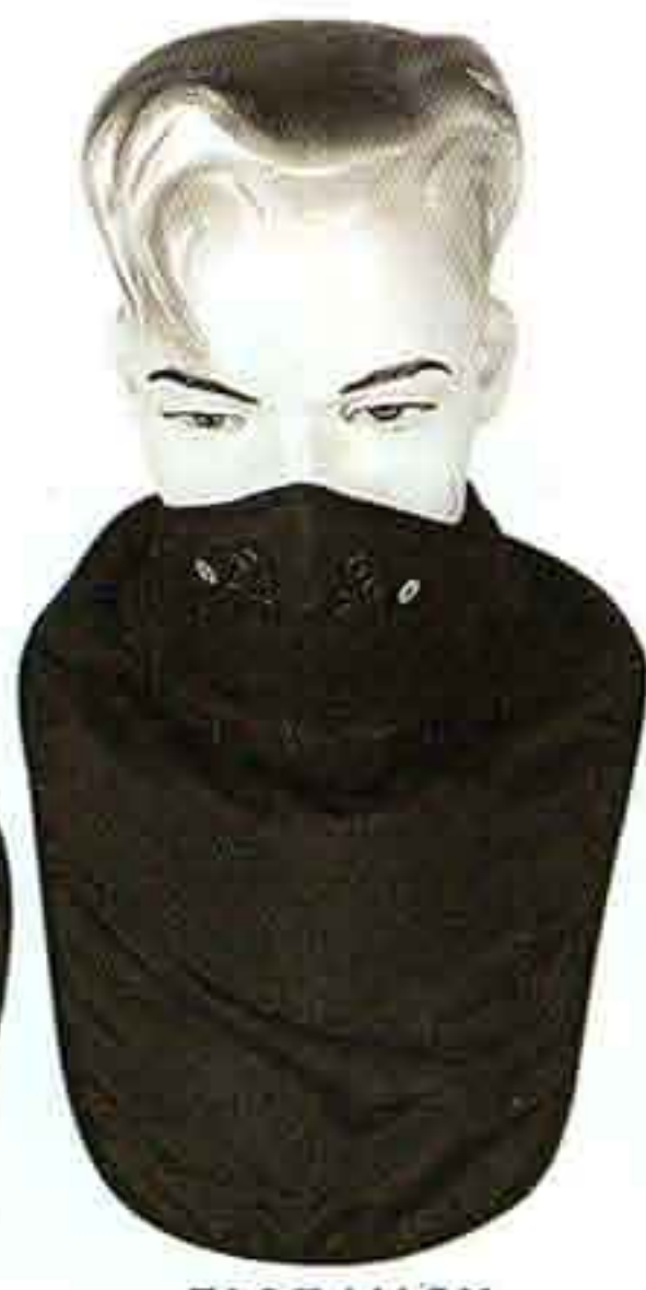
FACE MASK MICRO FIBER FOAM & POLYESTER LINING.