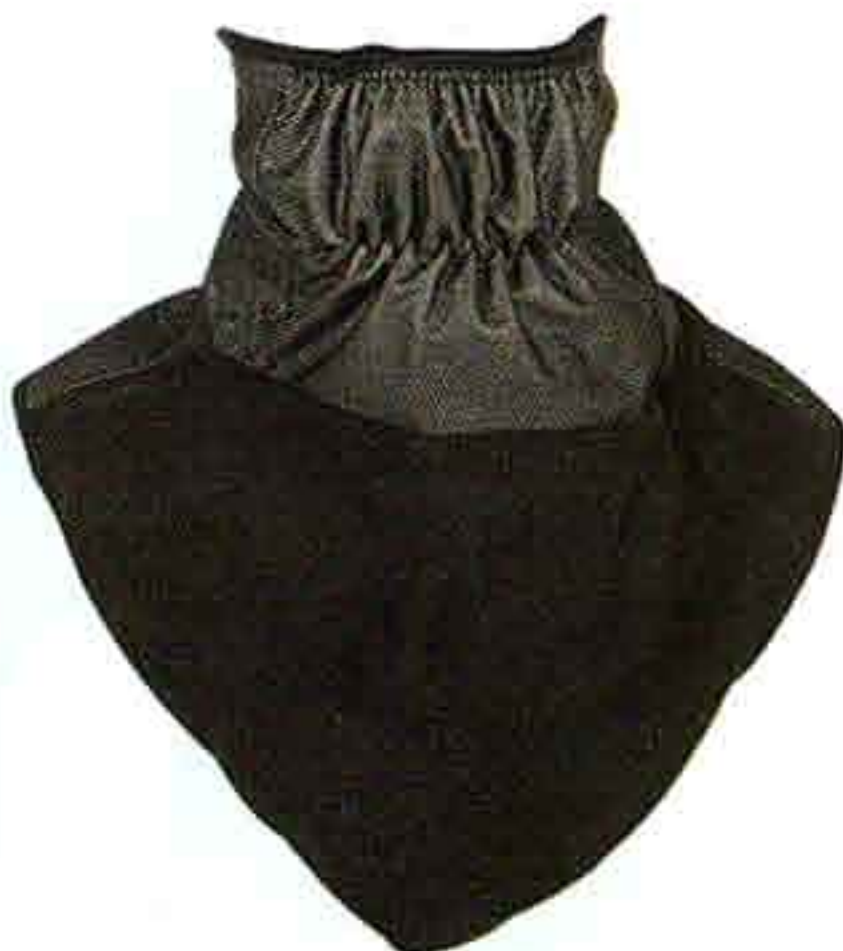
WIND STOPPER FACE MASK