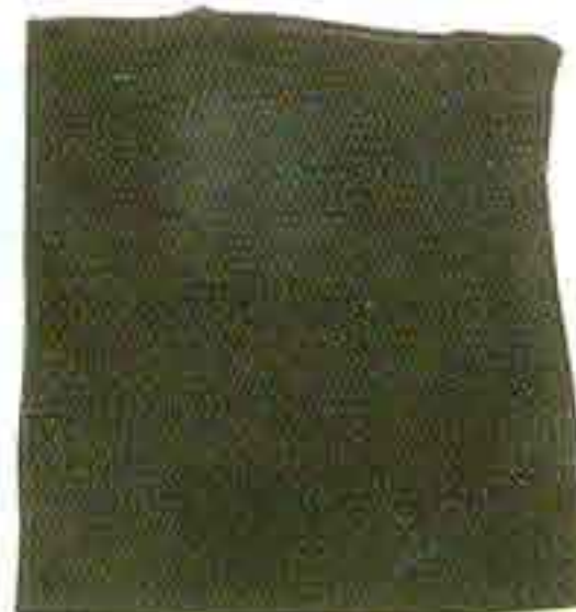
LONG NECK COVER