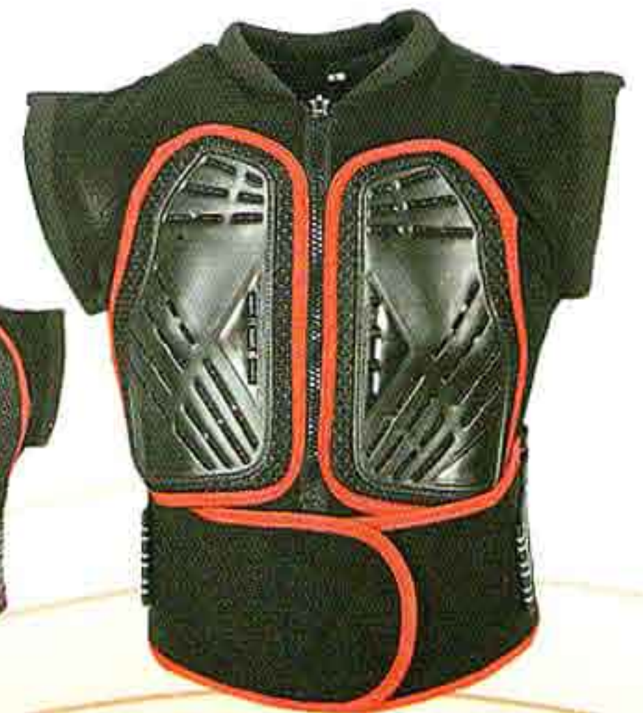
SLEEVE LESS PROTECTORS STYLE - 201102 RED